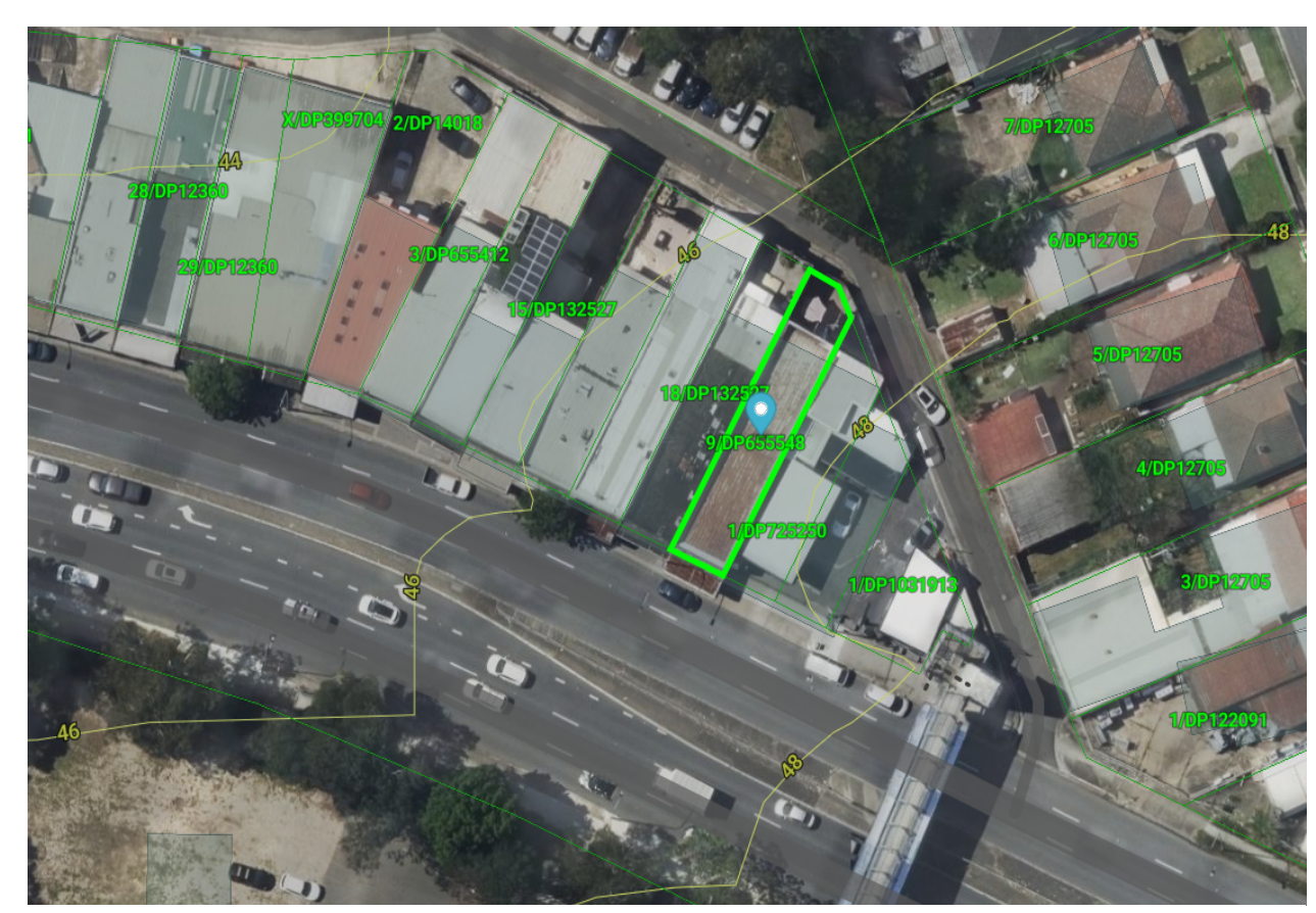
SITE ARIEL CONTEXT